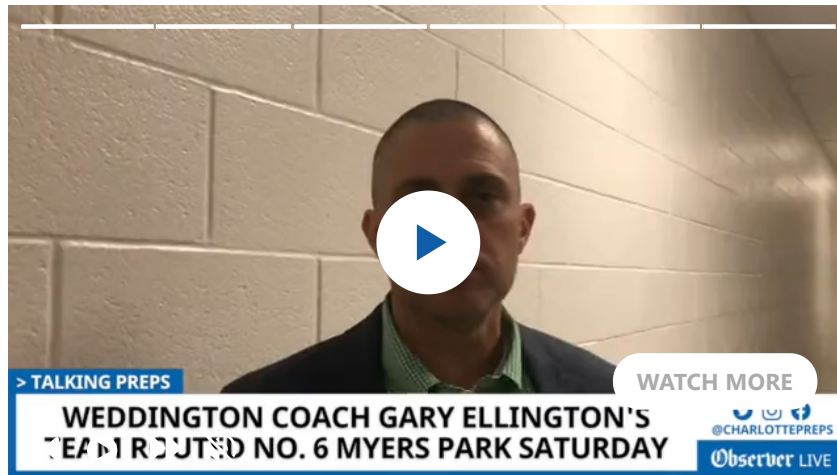
Weddington routs Myers Park in Cabarrus County